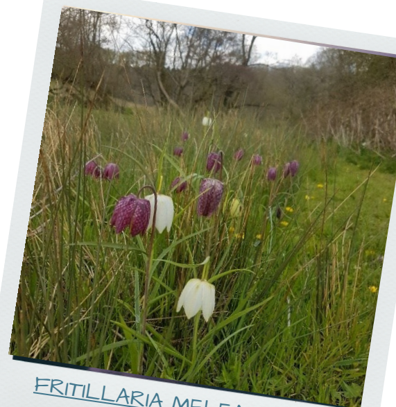
FRITILLARIA MELEAGRIS OR SNAKES HEAD FRITILLARY

OS Explorer Maps: 116 Lyme Regis & Bridport and 129 Yeovil & Sherborne